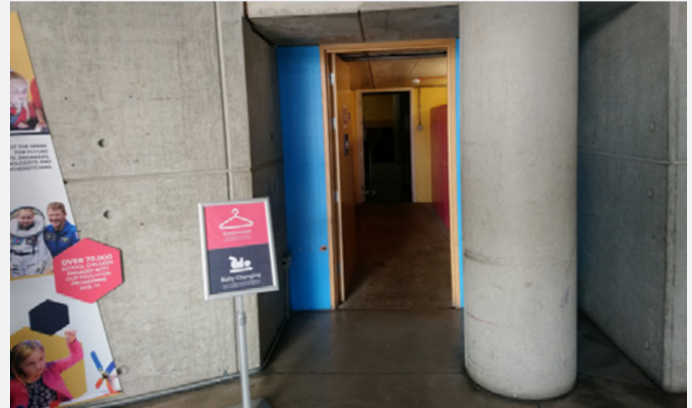
CLOAKROOM & BUGGY PARK

Anyone who requires a changing area can access the First Aid room. Please note that GSC does not have a hoist on site, however we are happy for visitors to bring their own. Please contact our bookings office in advance to advise on 0141 420 5000 .