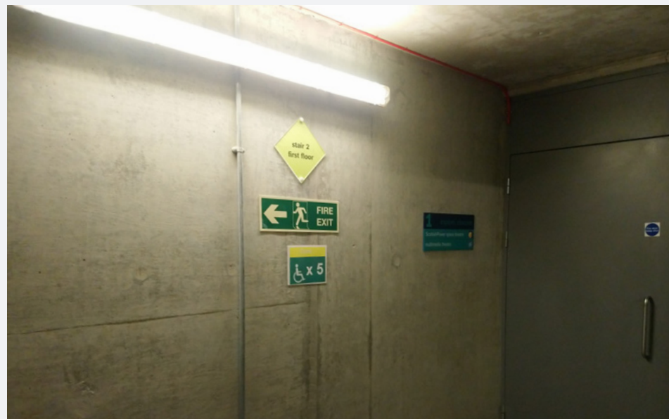
REFUGE AREA CORE 2 FLOOR 1

In the unlikely event of an evacuation of the Glasgow Tower cabin, the descent is via a 523 step spiral staircase. If you are not sure you or those you are responsible for can manage this in comfort and safety please speak to our staff before visiting.