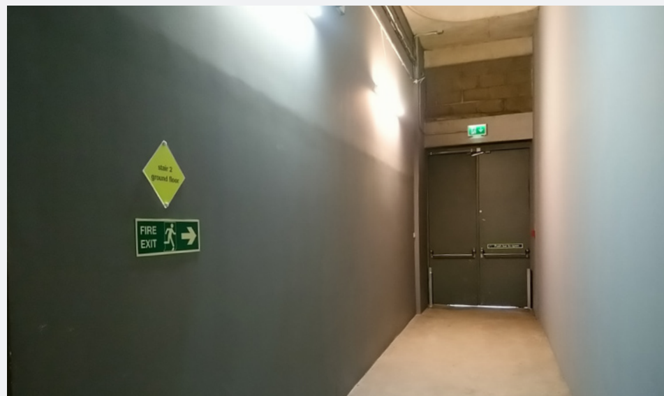
FIRE EXIT CORE 2 GROUND FLOOR