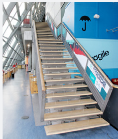
STAIRS TO FLOOR 2