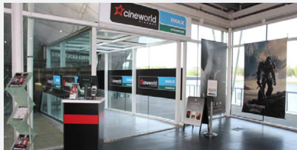
CINEWORLD IMAX ENTRANCE