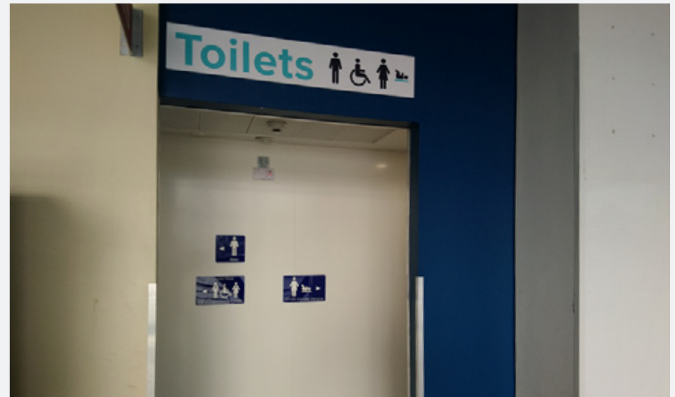
GROUND FLOOR TOILETS