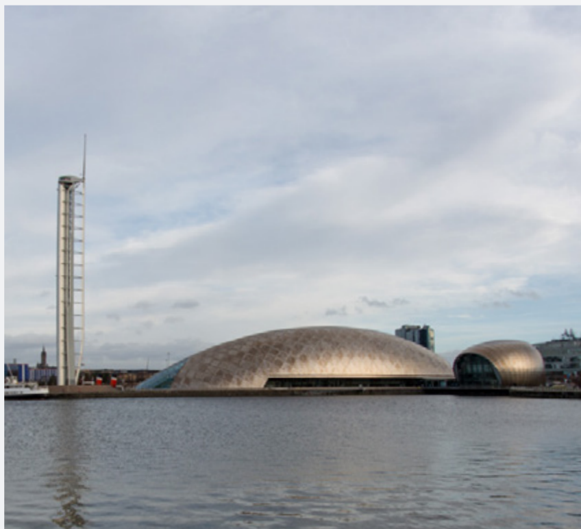
GLASGOW SCIENCE CENTRE

The gleaming titanium crescent that overlooks the Clyde has three floors packed with hundreds of interactive exhibits that will fascinate you.