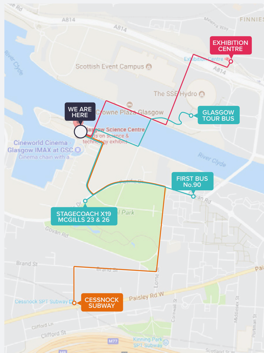
PUBLIC TRANSPORT MAP

The nearest station is Cessnock . Exit the station and turn left, then turn right onto Brand Street and then left onto Lorne Street. Turn left onto Pacific Drive and the entrance to Glasgow Science Centre is at the traffic lights past the Village Hotel, this walk takes around 25 minutes.