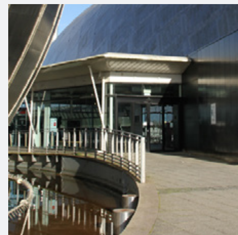
LINK BUILDING EXIT