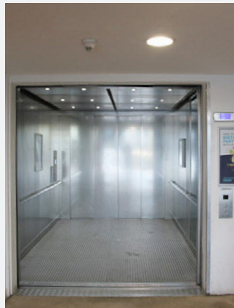
LARGE GOODS LIFT