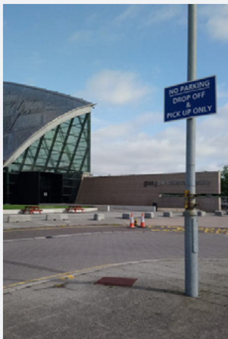
DROP OFF POINT

We also offer free parking for Blue Badge holders.