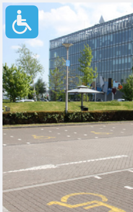
BLUE BADGE PARKING