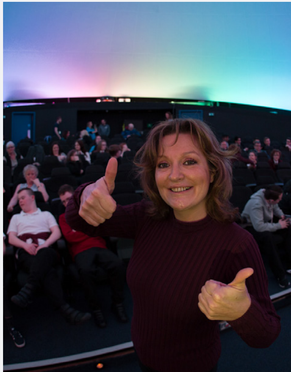
BSL INTERPRETER IN THE PLANETARIUM