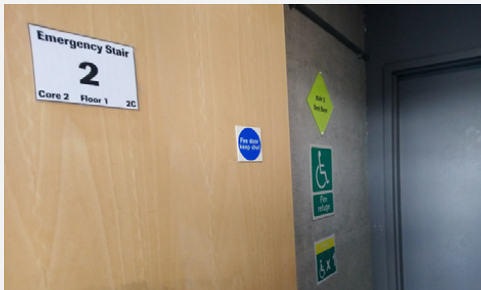
FIRE EXIT DOOR CORE 2 FLOOR 1