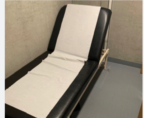
FIRST AID ROOM